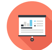
Best Case Study