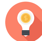
Most Innovative Product