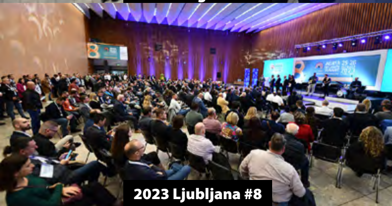
2023 Ljubljana #8