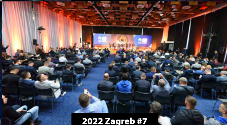
2022 Zagreb #7