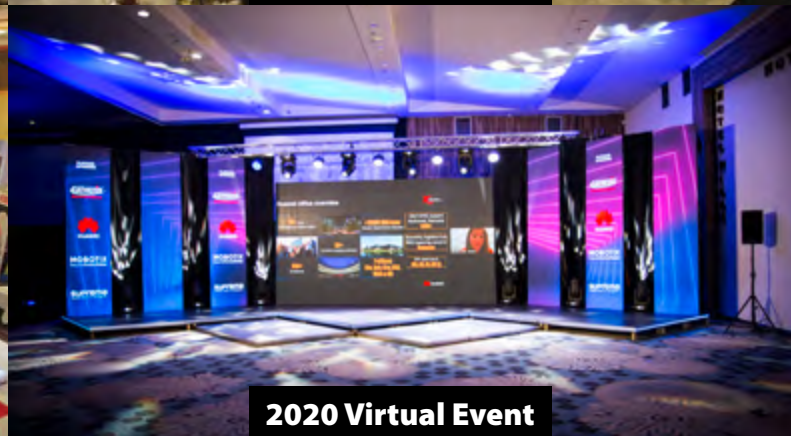
2020 Virtual Event