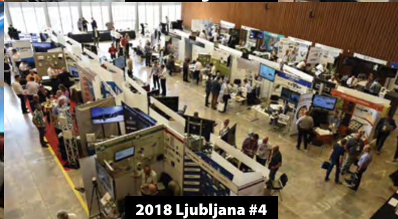
2018 Ljubljana #4