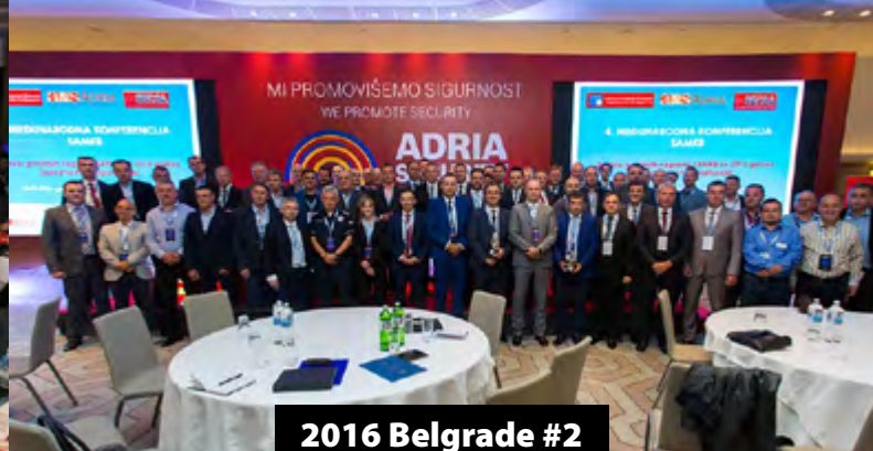
2016 Belgrade #2