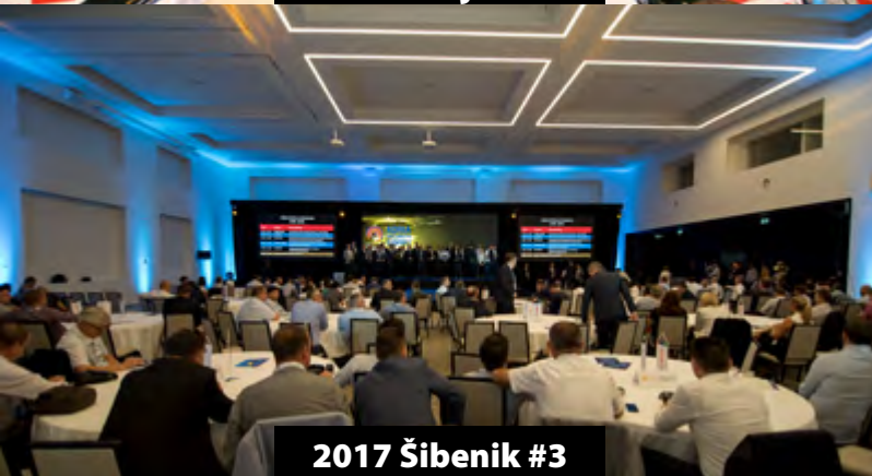
2017 Šibenik #3