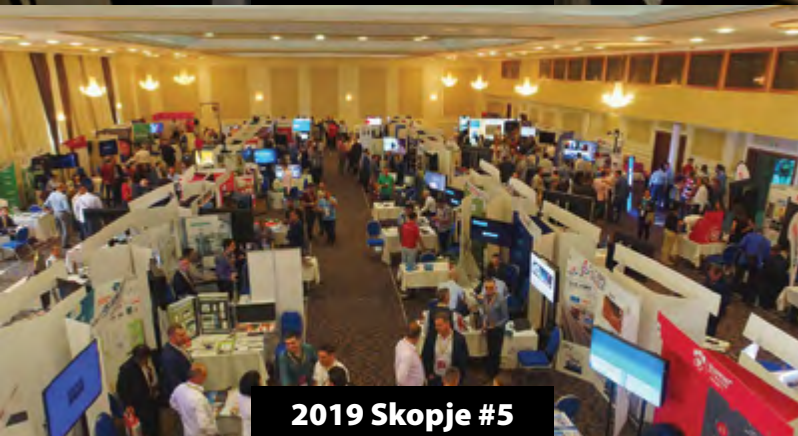
2019 Skopje #5