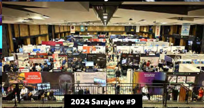
2024 Sarajevo #9