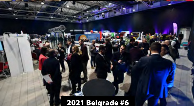
2021 Belgrade #6