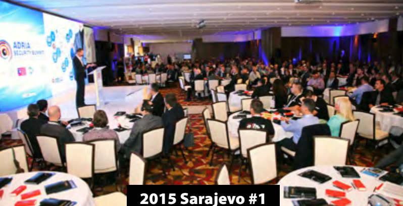
2015 Sarajevo #1